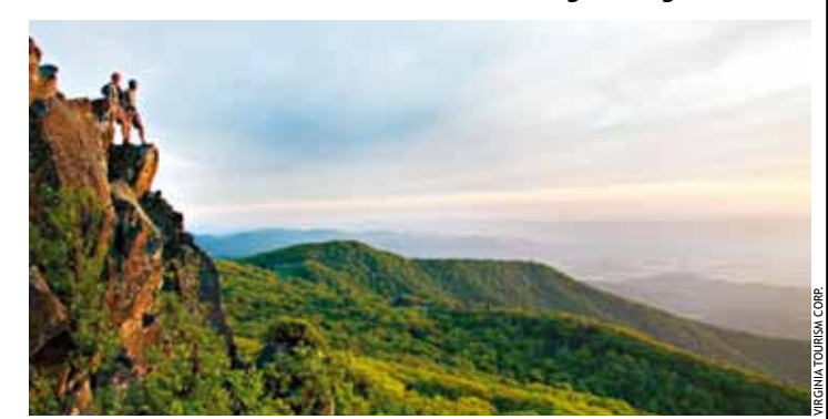
Shenandoah National Park, Virginia, United States