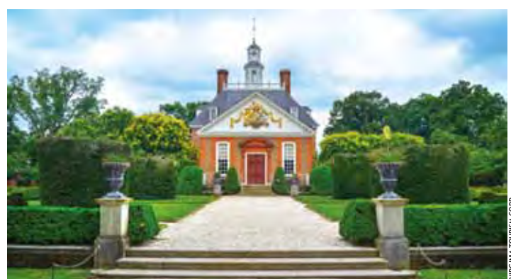
Colonial Williamsburg, Virginia, United States

"Virginia is for Lovers" has been the long-standing and iconic slogan of the state, dating back to 1969. Defying decades of usage, those words have remained relevant as a new generation of tourists discover more reasons to visit one of the original American states.